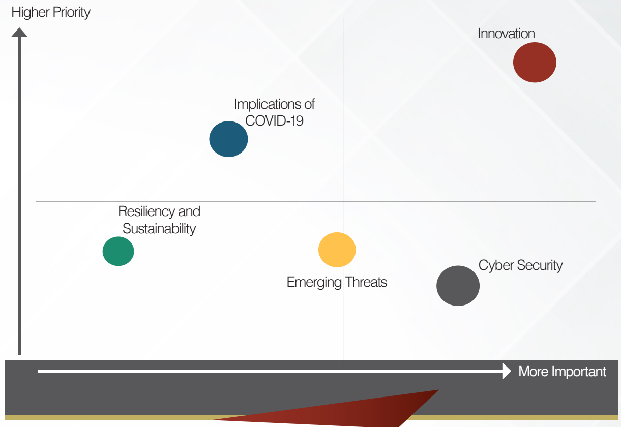
Figure 2 shows that while the implications of COVID-19 are a higher priority than most other issues, emerging threats and cyber security were ranked as more important. Innovation, in the upper-right quadrant, was ranked both most important and the highest priority. While firms are dealing with the immediacy of COVID-19, there is demand for innovation topics and help with innovation planning.