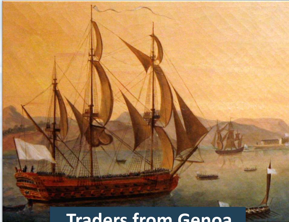
Traders from Genoa