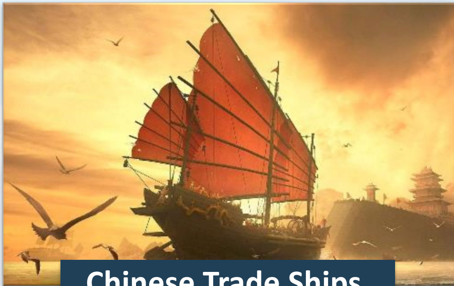
Chinese Trade Ships