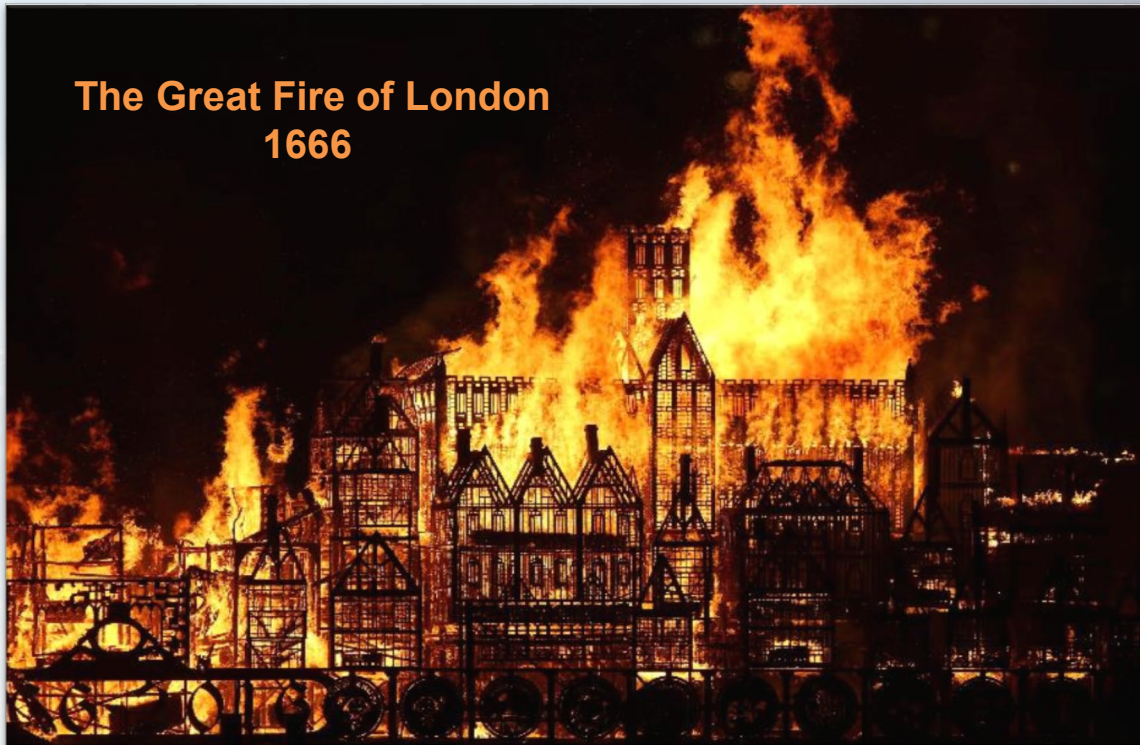
The Great Fire of London 1666