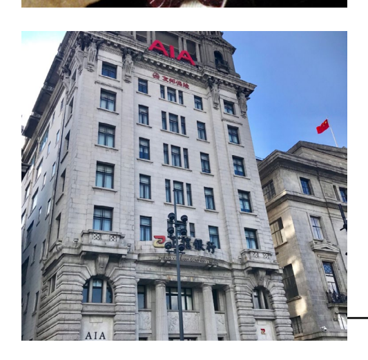
The AIA building on Zhonshan Road, Shanghai