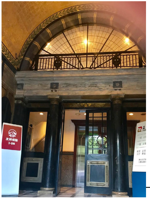
The grand lobby inside the building